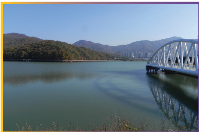
Lake Baek Un