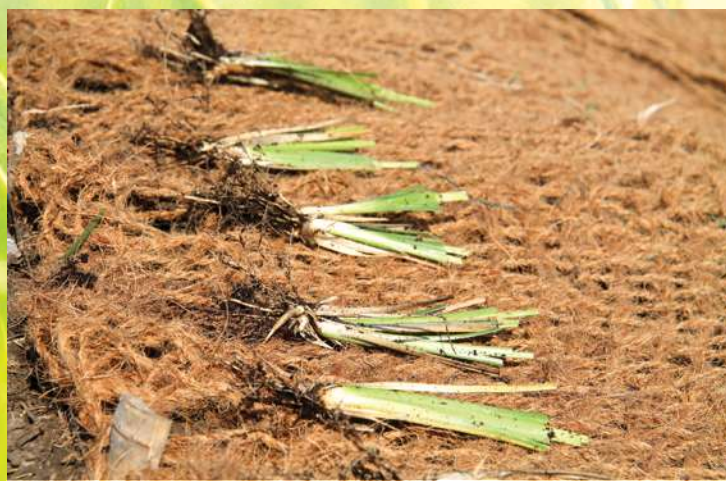
Vetiver Grass and Coconet as erosion control materials