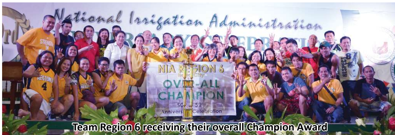
Team Region 6 receiving their overall Champion Award