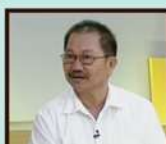
Department of Agriculture Secretary Emmanuel Piñol

Tamang tama po may kopya po kami ng interbyu kay Department of Agriculture Secretary Piñol makinig po tayong lahat sa kanyang panawagan.