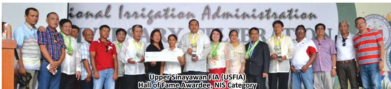
Upper Sinayawan FIA (USFIA) Hall of Fame Awardee, NIS Category

Meanwhile, the Office of the Comprehensive Agrarian Reform Program – Irrigation Component (CARP-IC) bestowed to the Gravity Irrigators Service Association, Inc. the coveted Most Outstanding CARP Irrigators Association for CY 2015 Award. The IA is served by the Upper Tuganay CIS in Sto. Tomas, Davao del Norte.