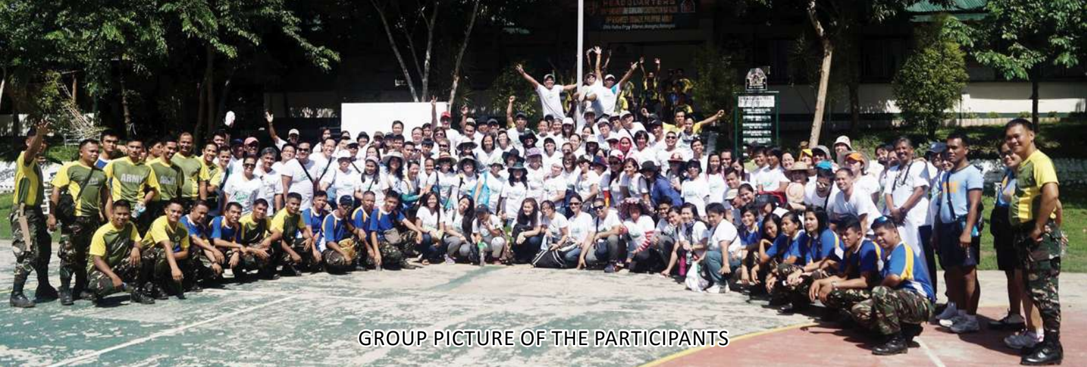
GROUP PICTURE OF THE PARTICIPANTS