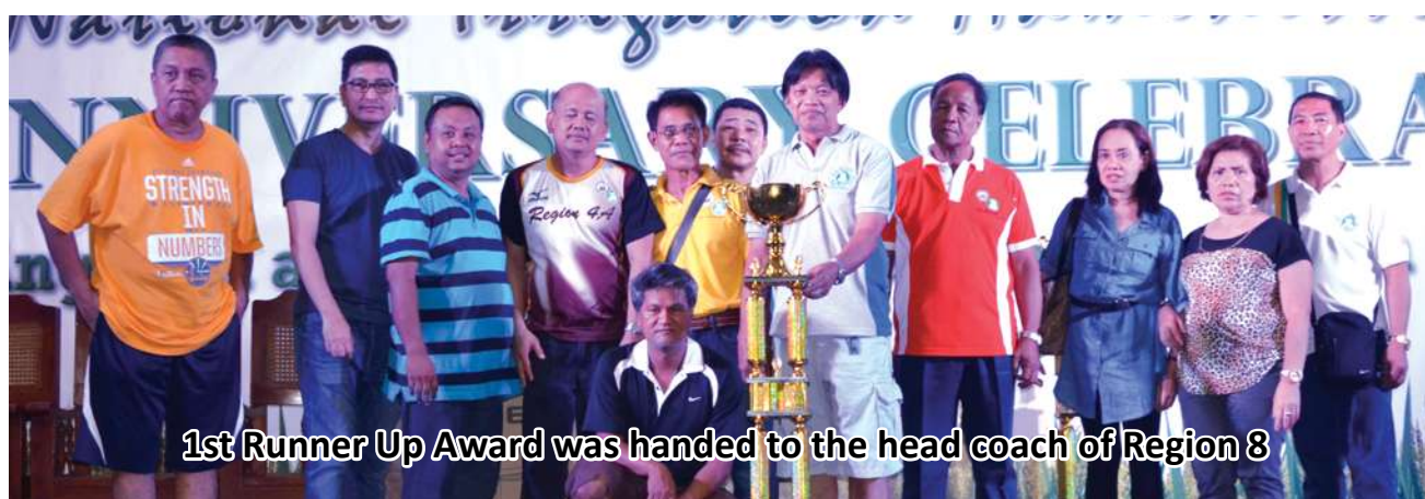
1st Runner Up Award was handed to the head coach of Region 8