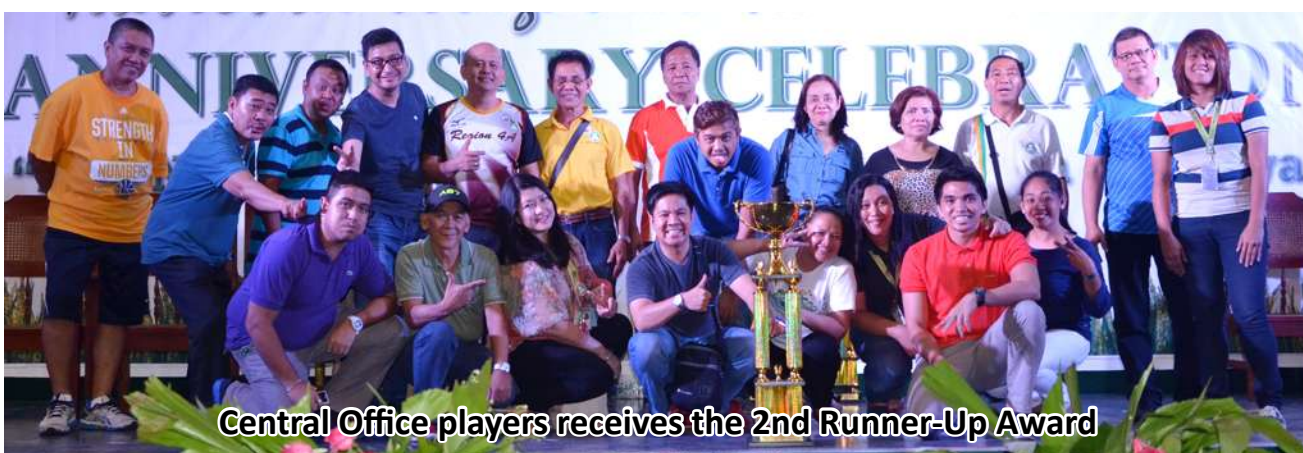
Central Office players receives the 2nd Runner-Up Award