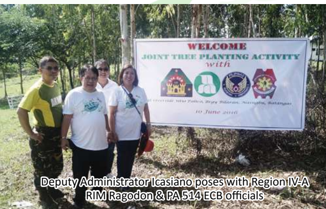
Deputy Administrator Icasiano poses with Region IV-A RIM Ragodon & PA 514 ECB officials

Indeed, trees beautify our environment but their values lie beyond the aesthetics. They remove carbon dioxide from the atmosphere, increase biodiversity in our environment, prevent soil erosion, as well as provide shade and lower the atmospheric temperature. Trees secure the future of our environment for the generations to come. Visual exposure to trees is also known to reduce stress levels in our fast-paced world. #