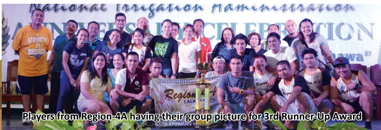
Players from Region-4A having their group picture for 3rd Runner-Up Award